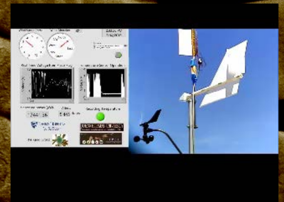
Self-Adapting Ambient Wind Energy Harvester