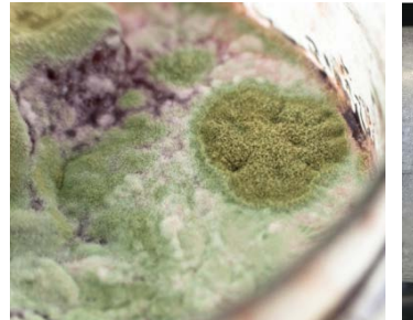
Germ-free Medical Devices