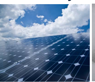
Easy-clean Solar Panel