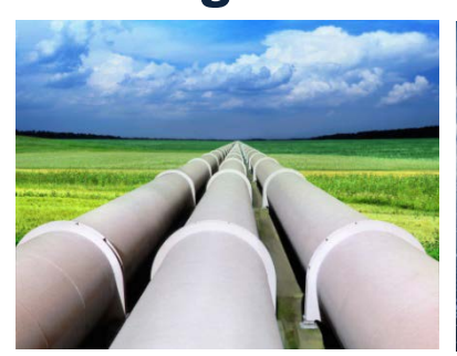
Drag-reduction Fluid Transport