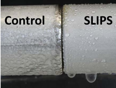
Energy-Efficient Heat Exchangers