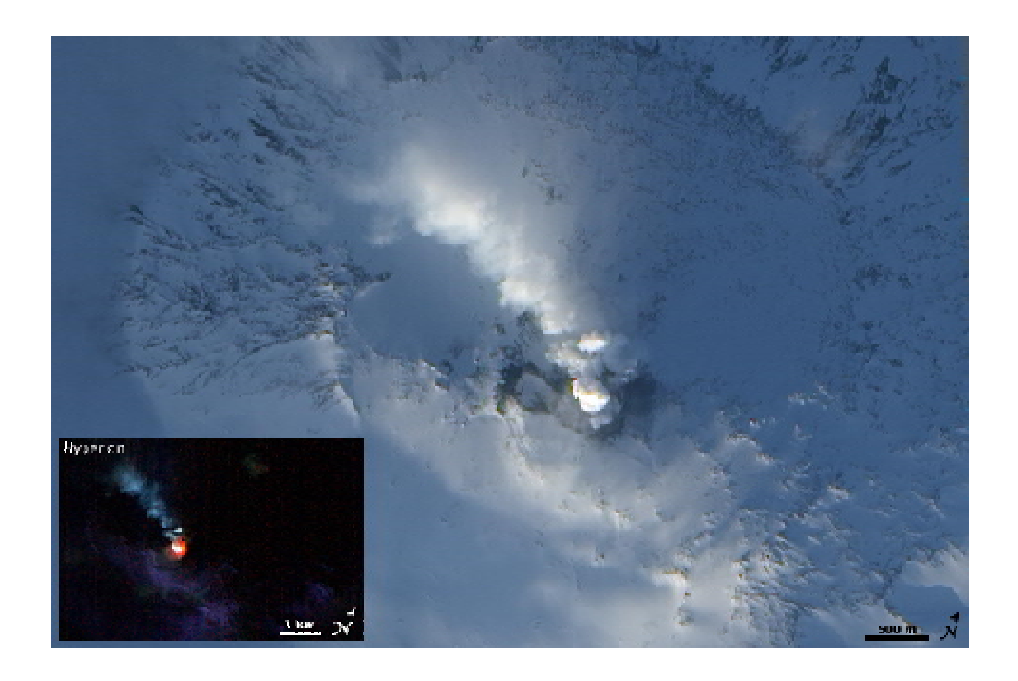
Figure 3: Images of volcanic Mt. Erebus, autonomously collected by EO1. NASA image created by Jesse Allen, using EO-1 ALI data provided courtesy of the NASA EO1 Team.

observation, and effectively detected the eruption by itself. Figure 3 shows a 2006 collection from EO1 of the same volcano.