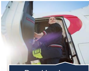
Road haulage industry