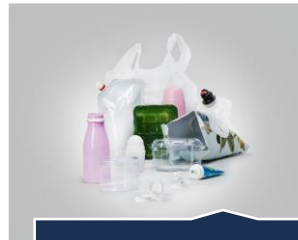
Food retail sector