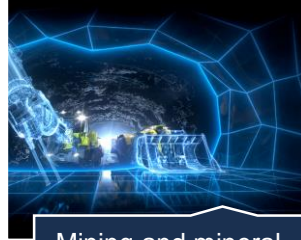
Mining and mineral industry